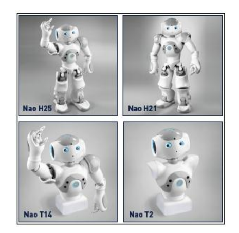
Fig. 3 Updates for the Nao robot

The robot Nao [21] French product of the ALDEBARAN Robotics firm is a robot that can be programmed through blocks through an easy conceptualization graphical interface. It has 25 degrees of freedom, that make the humanoid robot can walk, dance and to play football, feature that allows you to have its own category in the League RoboCup, as shown in the Fig. 3.