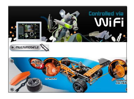
Fig. 2 Current developments group Meccano

This idea that has been adapted to technological changes through several generations to succeeded in assembling structures mechatronic including engines powered manually or by using a wireless remote control. The developments of last generation include the construction of Robots programmed and controlled through a computer in a local Wi-Fi or international way through a "global network", as shown in the fig. 2.