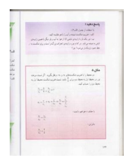
Page No. 22