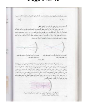
Page No. 102