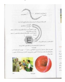
Page No. 139