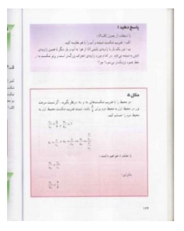
Page No. 134