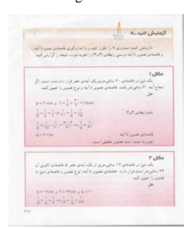
Page No. 111