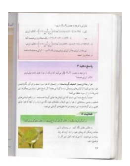
Page No. 46