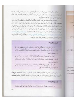
Page No. 17

Table 2, all kinds of random questions to separate the pages of the text of the first school-based physics textbooks (published in 2012) have been selected, it shows (Figure 3).