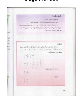
Page No. 158