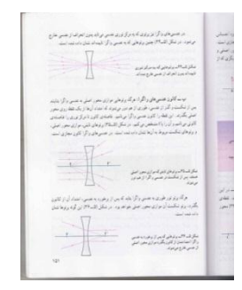
Page No. 151