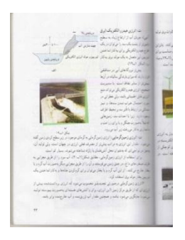
Page No. 23

In the present study, the first textbook on the basic physics of secondary school(published in 2012), especially secondary base first, which then tend to select students from various academic disciplines, selected for the study. Data Source element analysis textbooks (6 pages with random selection) (Figure 2) shown in Table 1.