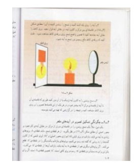
Page No. 104