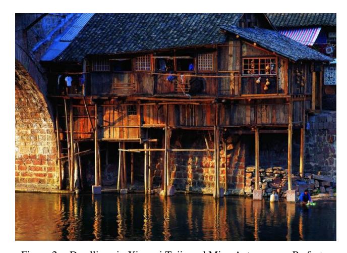
Figure 2. Dwellings in Xiangxi Tujia and Miao Autonomous Prefecture – Stilted building [4]

However, just owing to the relatively closed environment, inadequate transportation facilities and communication, and the lack of communication with the outside world, Very valuable national cultural tourism resources can be preserved in this region. Part of Tujia and Miao's minorities are still living together in accordance with their ancient nation form, and come into being many stockades. Residents are still living in the nation's unique architecture. For example, part of the Miao people still maintain their original national characteristics, such as living in the stilted building, dressing in Miao clothes, and wearing the silvers (Figure 2). These are the very unique tourism resources.