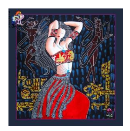
Figure 5. Miao's batik crafts[16]

Leather drums of Miao, Waving dance of Tujia, embroidery, pick embroidery, brocade, batik, paper cutting, silver, and bamboo are extremely rich ethnic characteristic handicraft (Figure 5) [15].