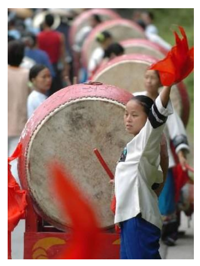
Figure 4. Miao welcome drum[12]