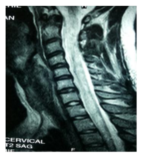
Figure 2. Sagittal section MRI cervical weighting T2 (May 2015)

International Journal of Science and Engineering Investigations, Volume 6, Issue 67, August 2017