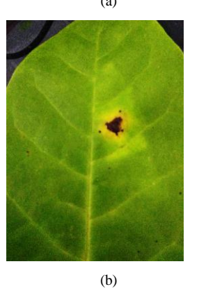
Figure 3. A: Symptoms of leaf specks on the chrysanthemum, B: Chrysanthemum seeds attacked by leaf spot disease during Koch postulate activities