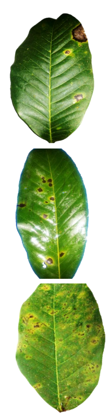
Figure 1. Leaves on cempaka leaves

The initial sign of leaf spot disease in the infestation in 3 agroforestry land locations is that on the leaf surface there is necrosis in the form of stains or patches with brownish color that has a clear boundary (Figure 1).