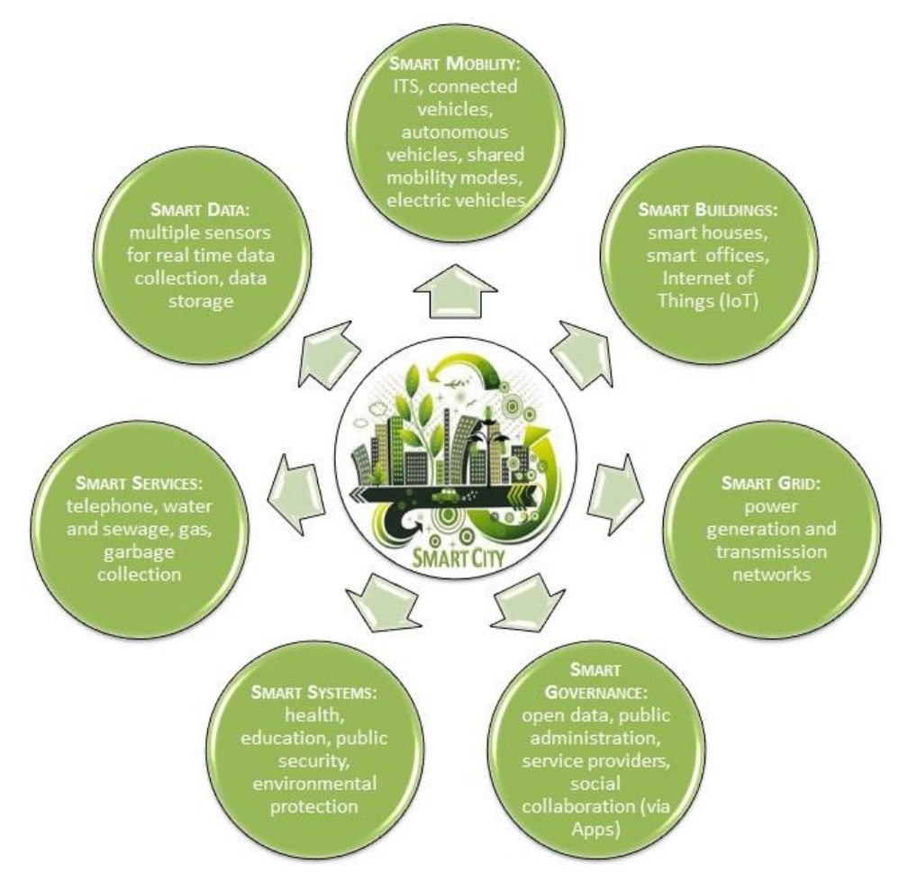
Figure 1: Smart cities and their systems.

Therefore, smart cities, as shown in Fig. 1, must optimize usage and exploitation of tangible (transportation and logistics infrastructure, energy distribution networks, natural resources, etc.) and intangible assets (human resources, intellectual and organization capabilities from state bodies, etc.). However, to implement such undertakings, significant financial investment and time are required, on technology development, machinery acquisition and mainly human resources qualification, capable of generating innovation and operating the system [2].